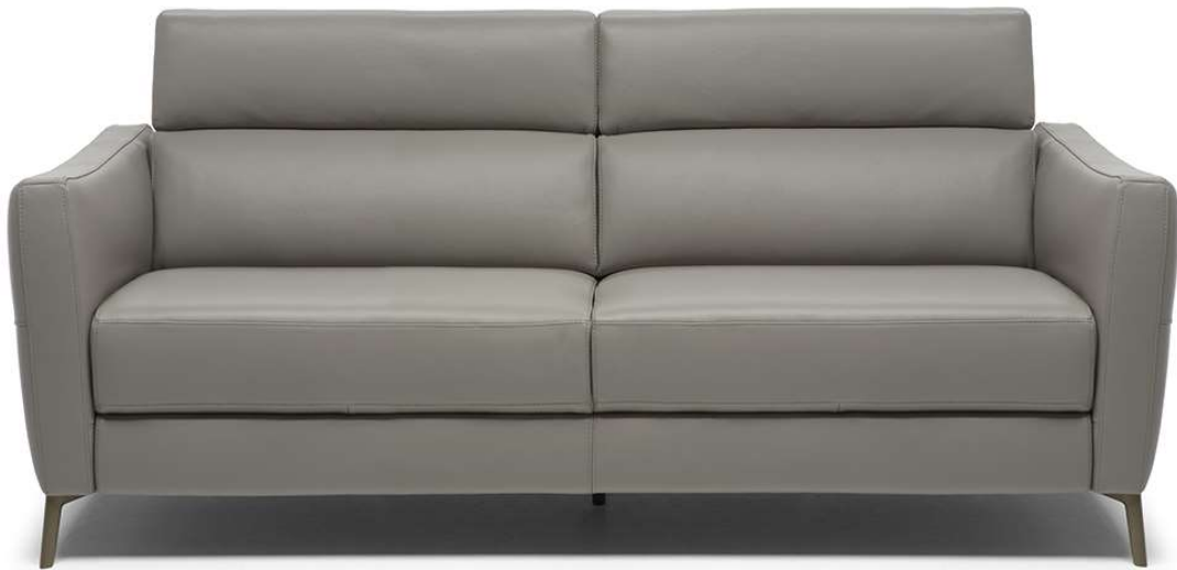
■ Vers. 009