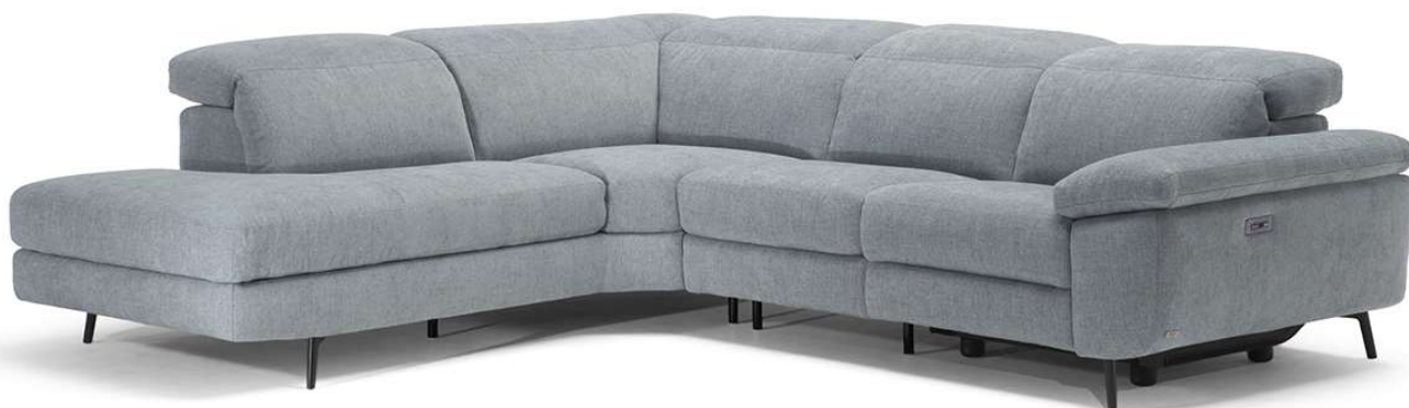
■ Vers. 480+F83