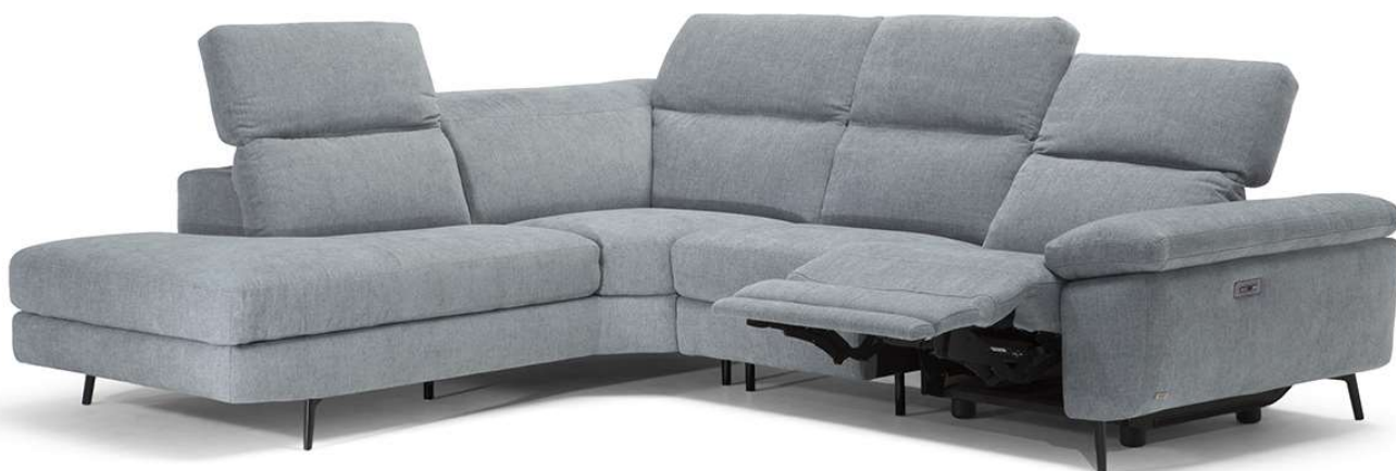
■ Vers. 480+F83