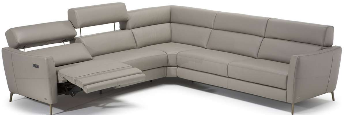
■ Vers. F50+F38+011+019