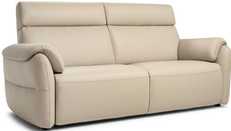
■ Vers. 009