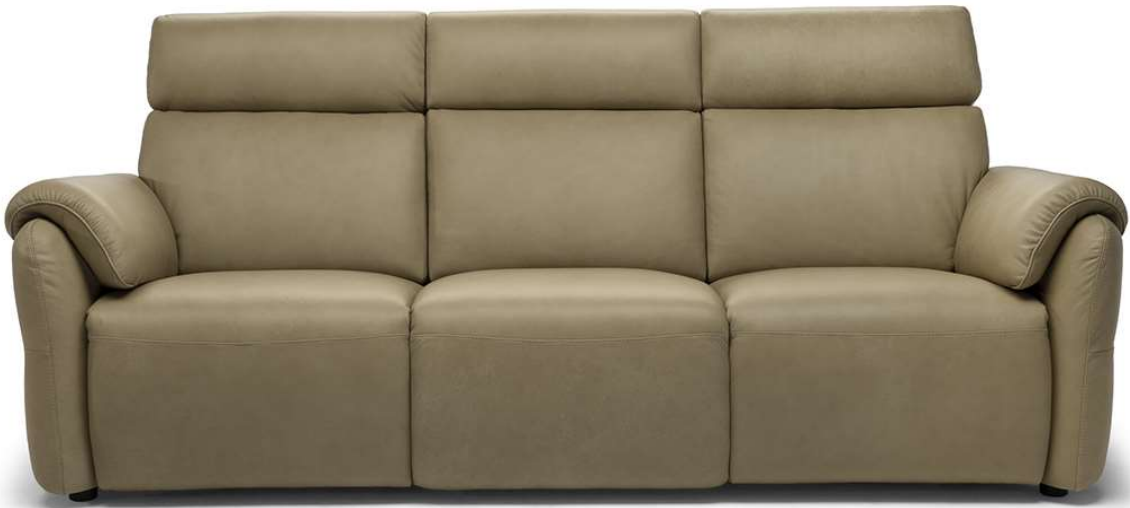
■ Vers. 155