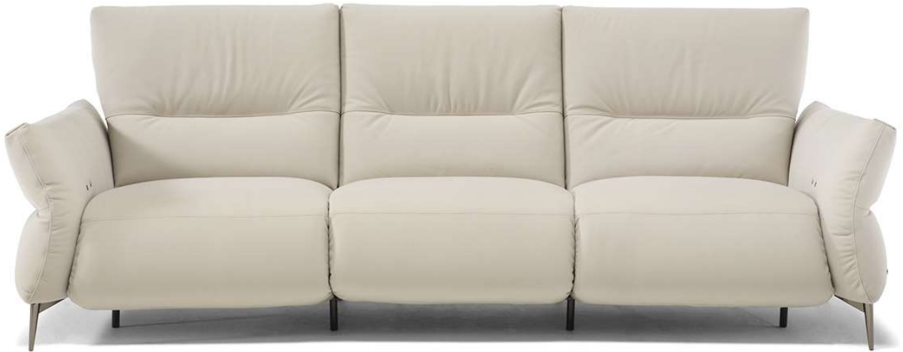
■ Vers. 450+338+452