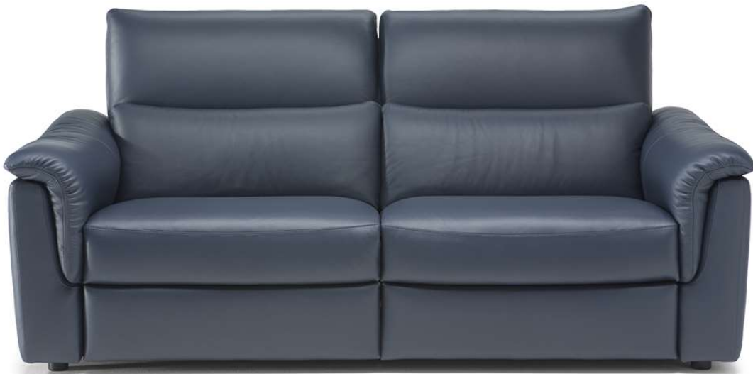
■ Vers. N46