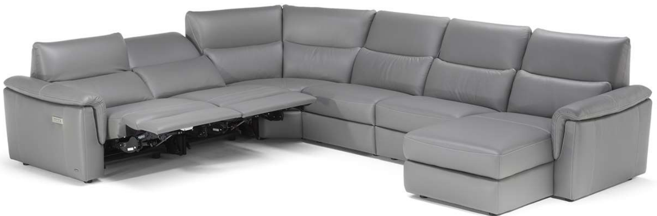
■ Vers. N50+N38+076+291+291+049