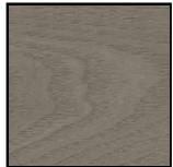
Ash wood tobacco