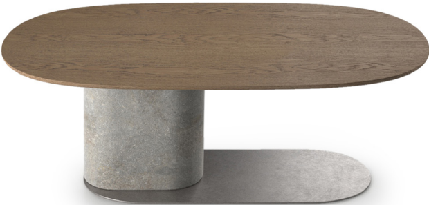
■ T848001XNA (draft image)