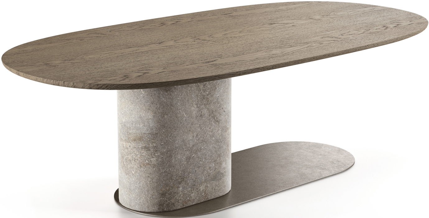
■ T848002XNA (draft image)