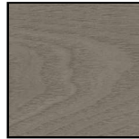
Ash wood tobacco