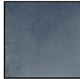
EAU DE MER