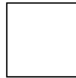
Rain Forest Brown