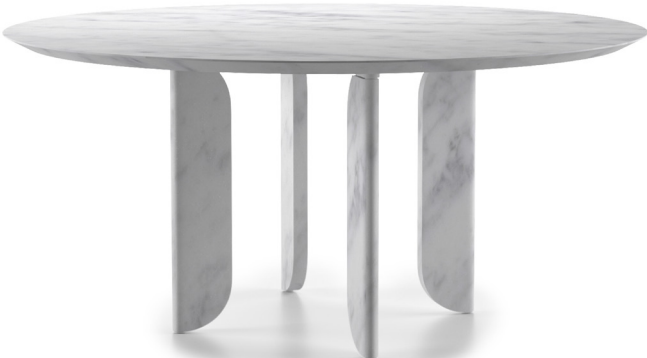
■ T873001XNA (draft image)