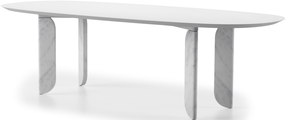
■ T873003XNA (draft image)

ALL PICTURES SHOWN ARE FOR ILLUSTRATIVE PURPOSE ONLY. ACTUAL PRODUCT MAY VARY DUE TO PRODUCT ENHANCEMENT.